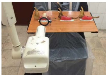
Figure 1: Periapical image of premolar tooth by parallel procedure in separate holes drilled in mandibular bone of sheep

The current in vitro study was conducted on 40 single-rooted human premolar teeth that were recently drawn. The teeth were fixed with wax in the socket of sheep's alveolar bone. To simulate soft tissue, three layers of wax were applied on sheep mandible. The alveolar bone was vertically fixed on the base by putty. An indirect digital radiography plate (PSP) was used as the receiver that was placed at a constant distance of 10 cm from the radiographic tube. The alveolar bone was placed between the radiation source and 5 cm away from the receiver. Indirect digital images (PSP) of each tooth were prepared separately by the periapical imaging apparatus (XGenus, De Götzen SRL, Varese, Italy) (Figure 1).